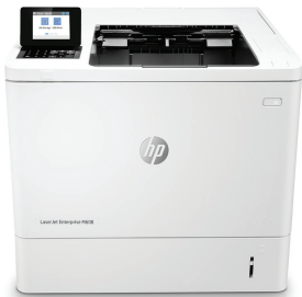
HP LaserJet Enterprise M608dn